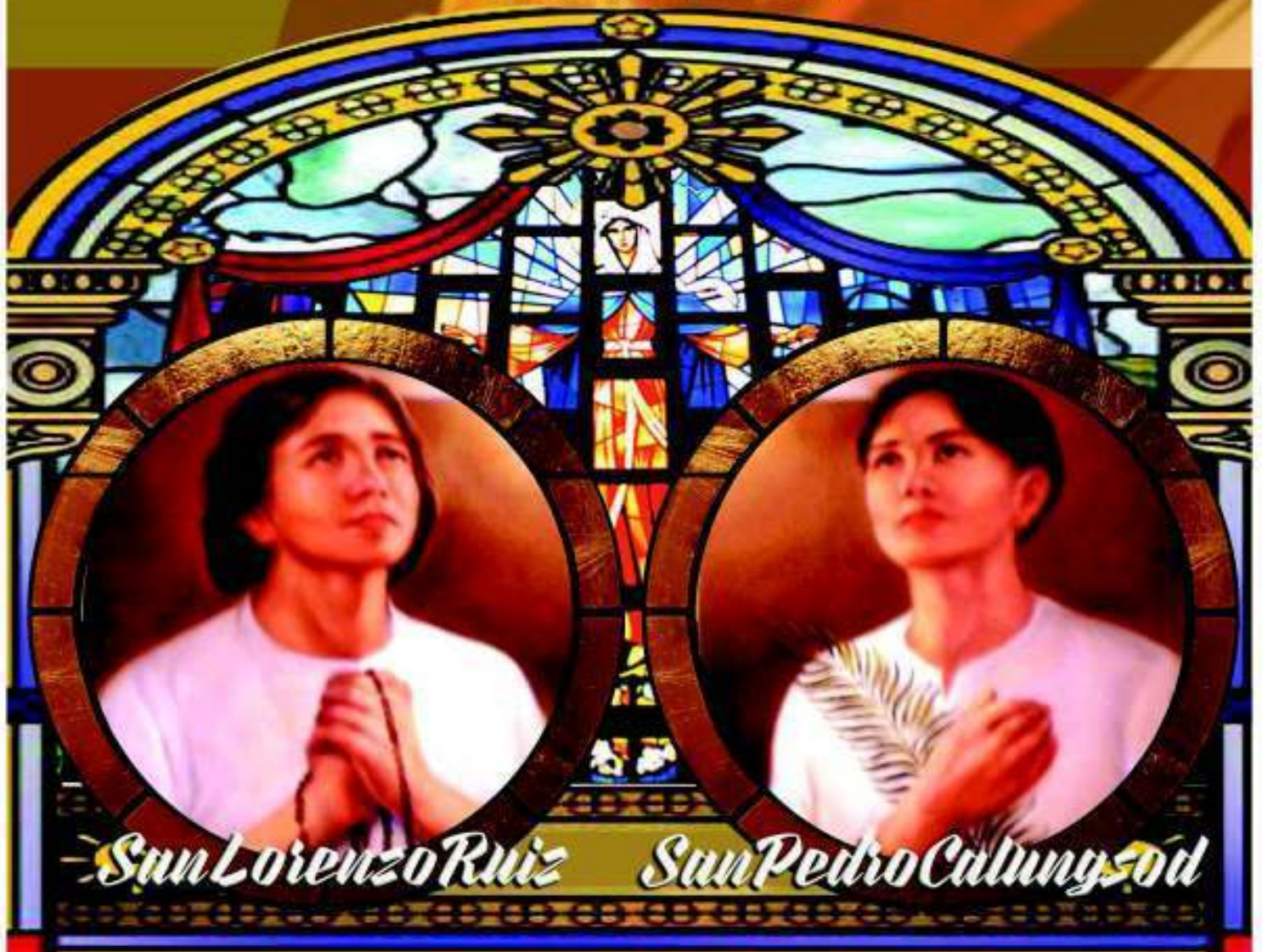
San Lorenzo Ruiz